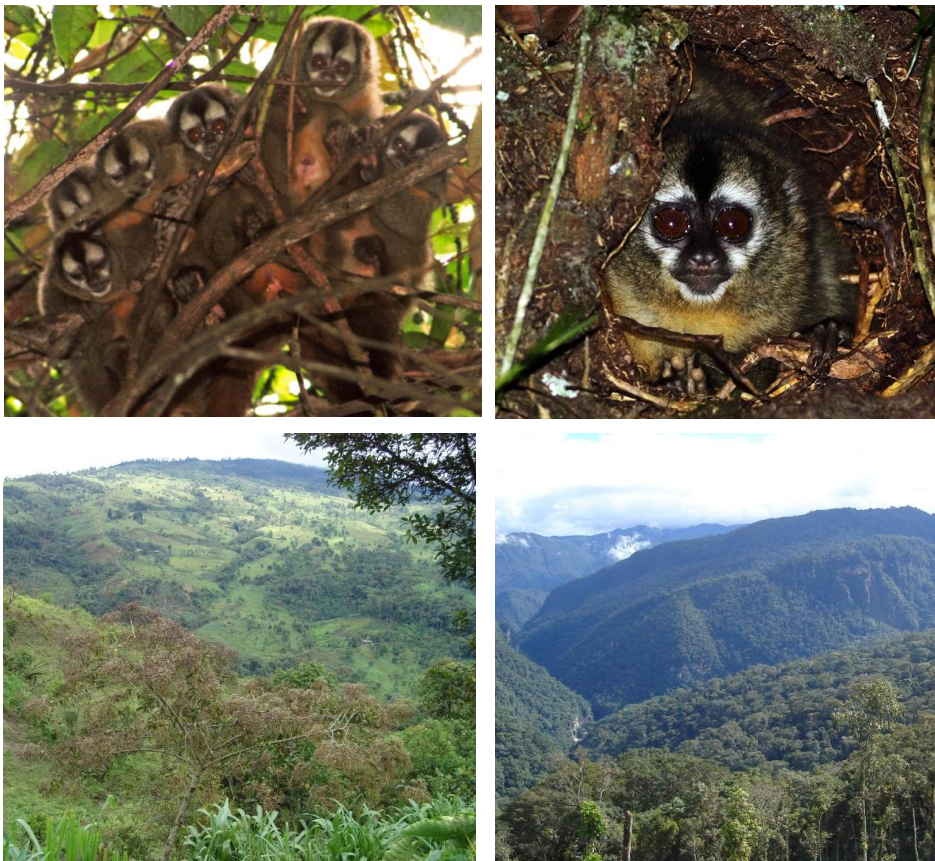
Fig. 3. Clockwise from top left: Study group in vine tangle nest (copyright Sam Shanee/NPC); Adult from study group in nest in hollow tree trunk (Copyright Jean Paul Perret/NPC); Undisturbed forest habitat of A. miconax (Copyright Sam Shanee/NPC); Fragmented forests near La Esperanza study site (Copyright Sam Shanee/NPC).

Our estimate of home range size represents a minimum of the actual space used by this group. For example, on a number of occasions the group was seen to descend to the ground and leave the forest patch to access isolated food sources [23]. On another occasion a follow had to be abandoned after the group travelled past the northern edge of the patch where the ground falls away in a vertical rock face. We could not relocate the group that night and assume they descended the cliff face. How much difference this will make in range size is difficult to determine as resources outside of the home patch are scarce and located nearby. These forays outside of the normal home range are probably necessary for the group to survive in the forest patch. The need to utilize resources outside of the group's home patch could have been necessary because of the unusually long dry season during this study.